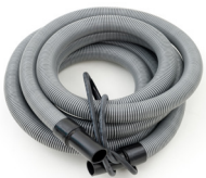
6m low pressure hose, up to 100psi