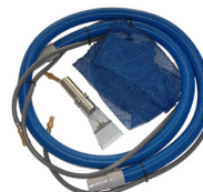
Upholstery cleaning kit, including hose and tool