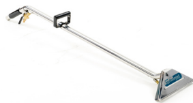
Wand - single jet stainless steel, up to 400psi